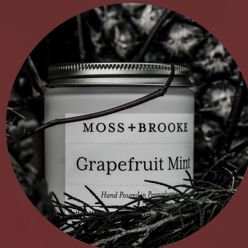
SHOPPING UNDER THE STARS