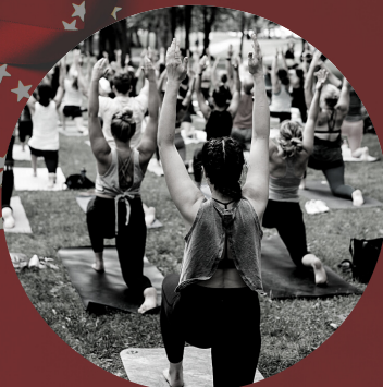
YOGA IN THE PARK

Shanti Yoga is back to host the sessions in Victoria Park this year, holding classes every Thursday from 12:05-12:55, in July, August, and September. This event is free for the public and helps us stay connected to the community.