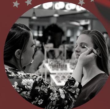
INTERNATIONAL WOMEN'S WEEK