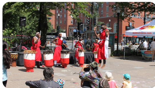
7TH Annual Children's Festival

The Association is also increasing efforts to forge alliances with the broader Spring Garden community. Working together on areas of common interest will give us a stronger voice to advocate for positive change. The residents and local community have been very receptive and we will make every effort to strengthen that in the year ahead.